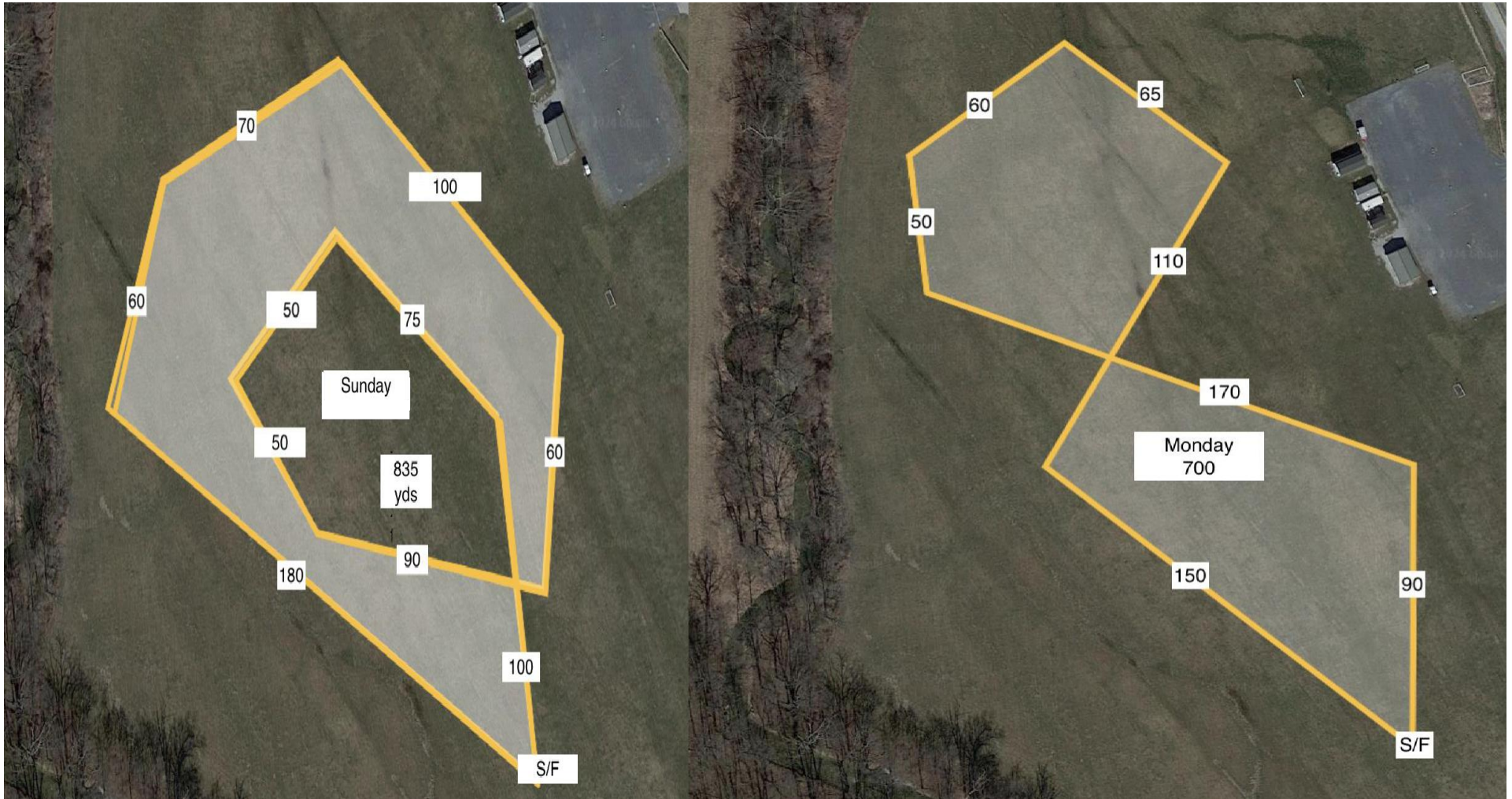
Course Plan Monday, May 25, 2026, 700 yds

Practice will be offered on Saturday and Sunday Only after JC and QC runs, weather, equipment and time permitting.